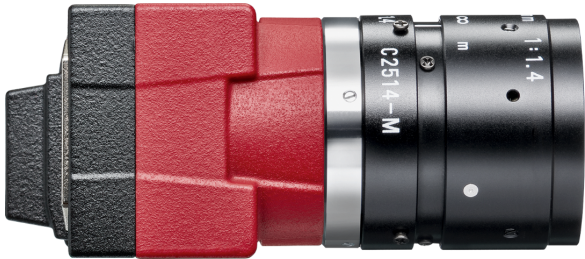
Model without hardware options